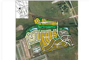
Community Homesite Map